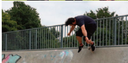
Clockwise from top: Have a break, have a cupcake; you've been framed; The WI ladies having a blast; Flying high with the Gnarwhal skate school; May the Force be with you; Putting pooches through their paces; the Bar of Chocolate that refreshes parts others can't reach.